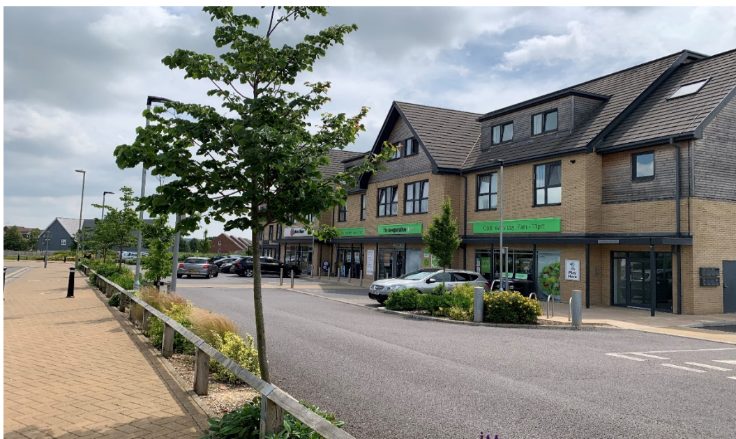
Image 1: Commercial facilities within the Local Centre in East Anton, Andover